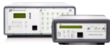
BR5 & MBR5 Backreflection Meter