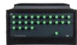
SX1 Optical Switch