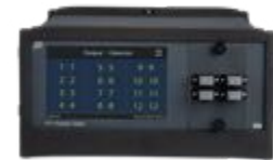
PT1 Polarity Tester