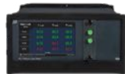
RL1 Return Loss Meter